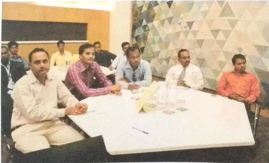
Participants of the Conference