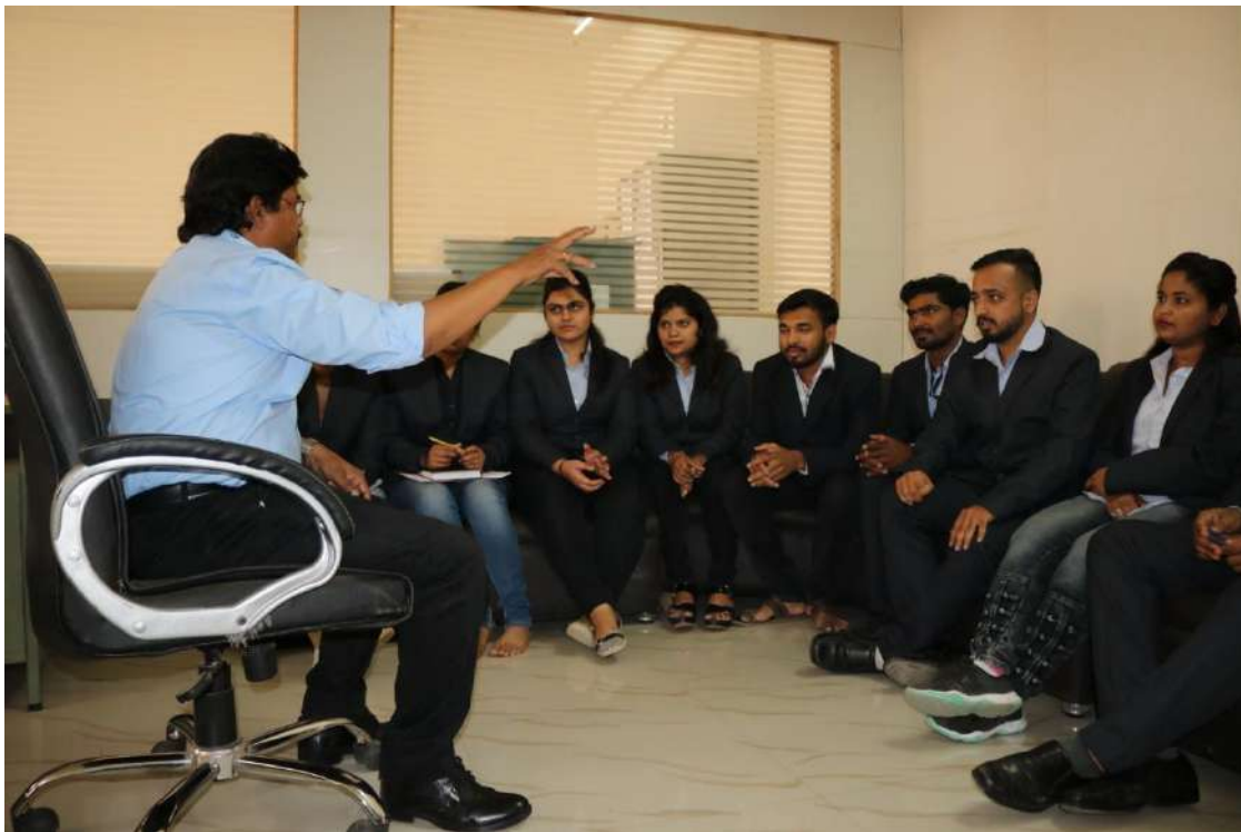
Fiesta Planning meeting with students