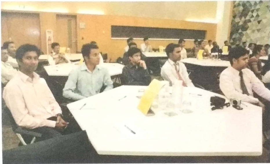
Participants of the Conference