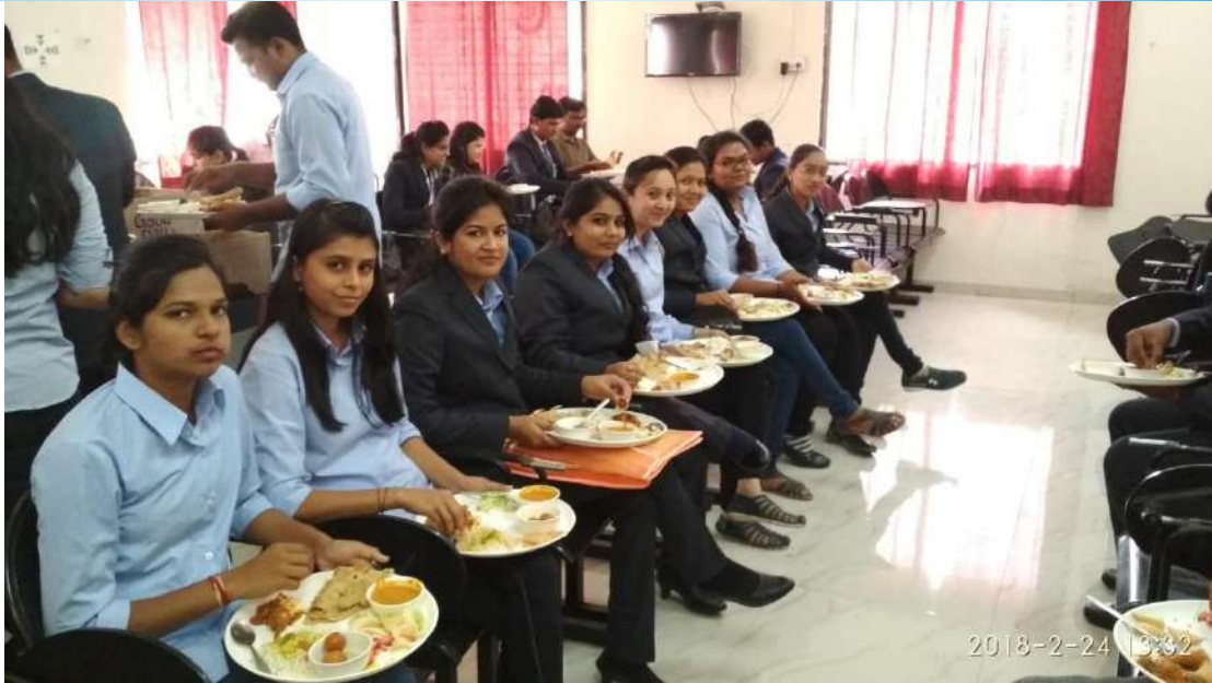
Students taking lunch at the seminar