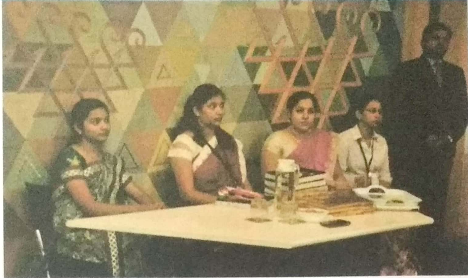
Participants of the Conference