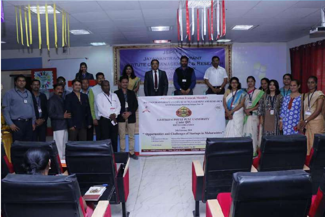
Participants of Seminar