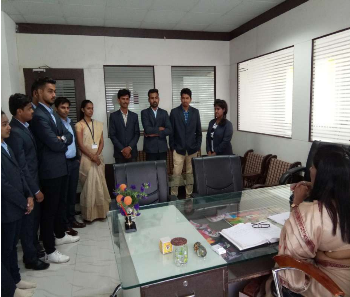
Students meeting with GFM and Director