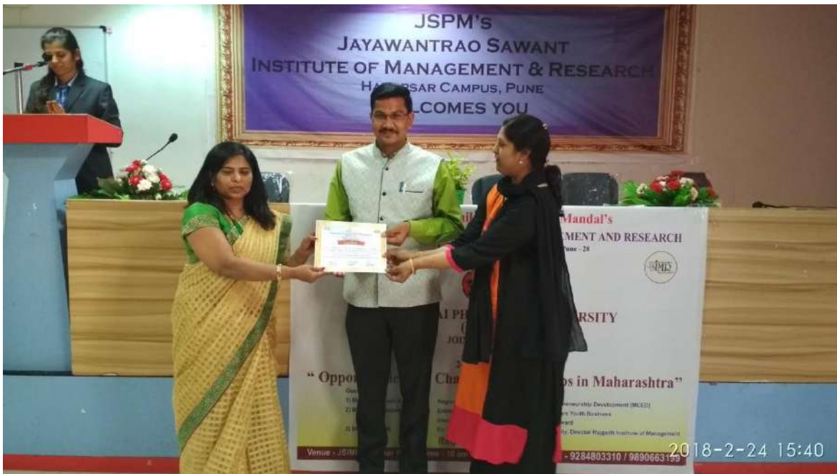
Certificates were distributed to participants of the seminar