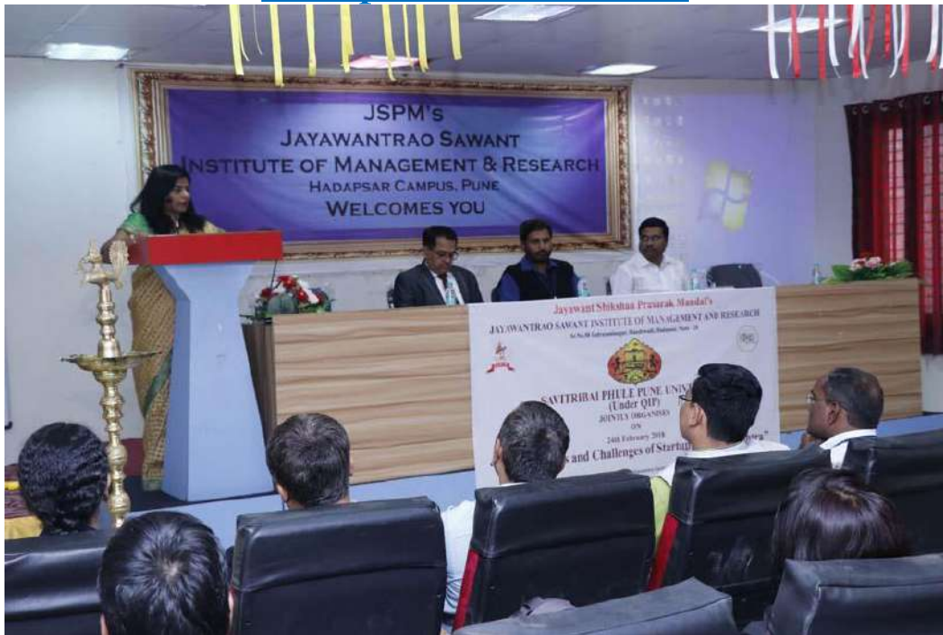
One day State level seminar on “Opportunities and challenges of Startups in Maharashtra”