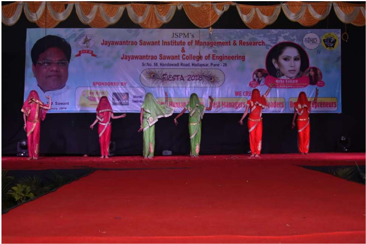
Dance Performance by Group